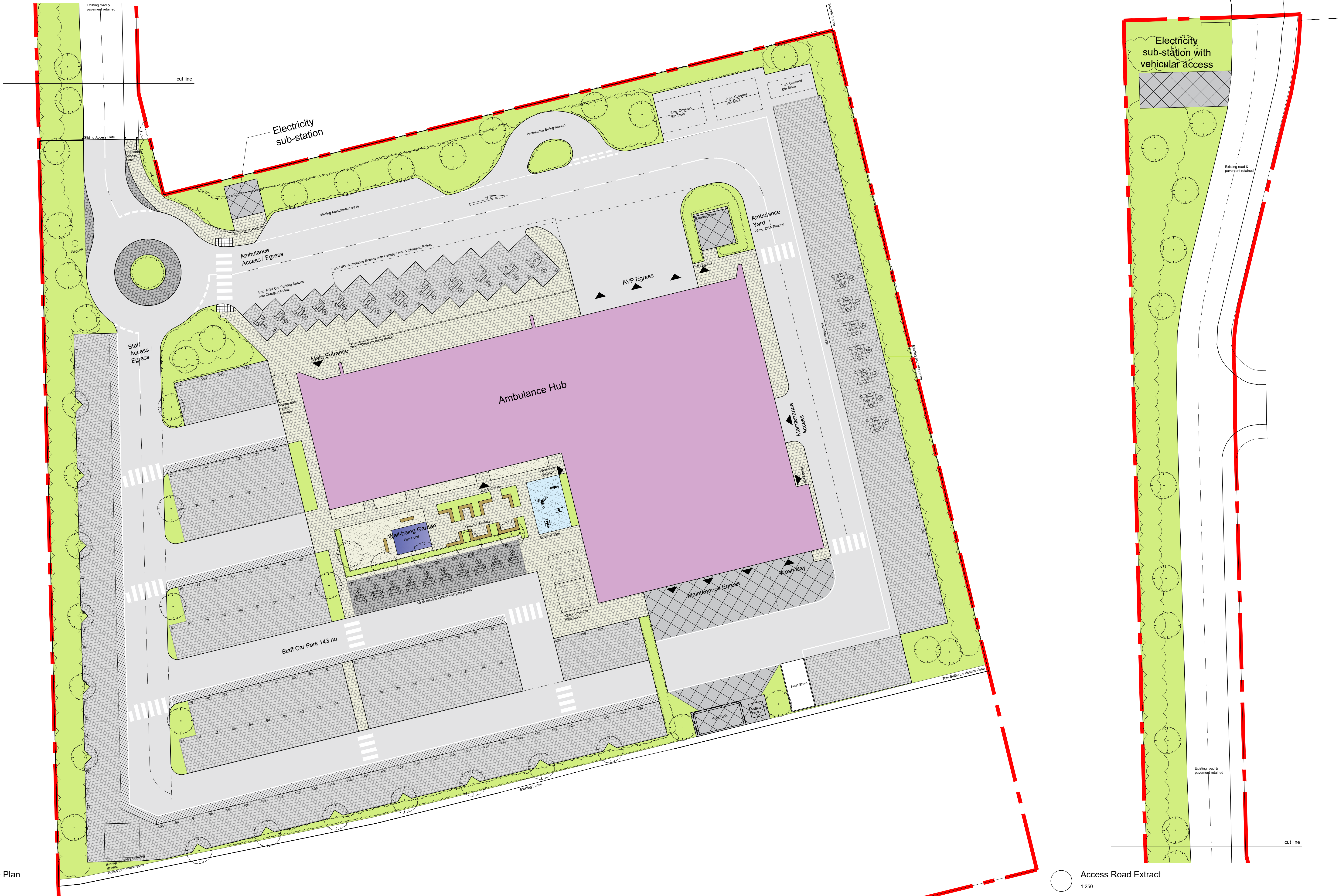
Proposed Site Plan 1:250